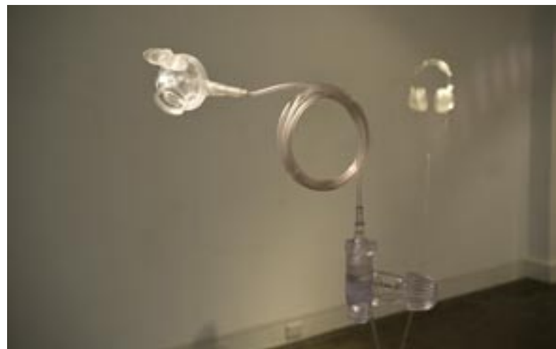
Images (previous page): Jay Kochel , thongs & pumps (detail) , 2009, Urethane and PVC pipe; (this page left top to bottom) Jay Kochel , two hands, four hands and TV (detail) , 2009, Urethane and PVC pipe; Jay Kochel , iPod and Breather , 2009, Urethane and PVC pipe; (this page bottom right) Jay Kochel , breathe , 2009, Urethane and PVC pipe.

To make this body of work, Kochel's studio was transformed into a pseudo-industrial laboratory. The artist constructed a rotational-casting device using a drill motor, bicycle chains, rubber bands and primitive gears. In the laborious process of moulding and casting, Kochel not only deconstructs the model but makes it transparent, allowing us to see inside precisely at the moment the object is rendered useless for practical purposes. The process involves gaining greater knowledge of the original, but it is not necessarily a functional knowledge. Objects are not pulled apart for their working organs but are transformed into transparent invertebrates or shells. The see-through object does not reveal a hidden function or meaning, but rather a hollow and empty beauty, as ghosts of our consuming desires and aesthetic whims. We find ourselves back at the surface, considering again how we use, know and view the object.